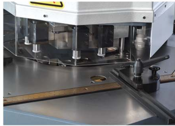
T-Slotted Table with Disappearing Stops Material Hold Downs